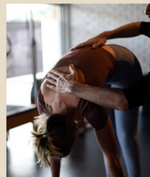
EDUCATOR OF THE YEAR