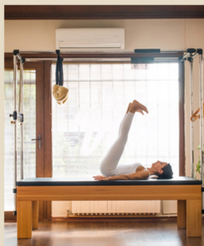
PILATES INFLUENCER OF THE YEAR