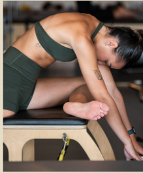
NEW INSTRUCTOR OF THE YEAR